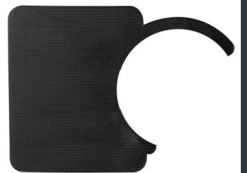
Specialty Versa 3 3D Scope Blocker